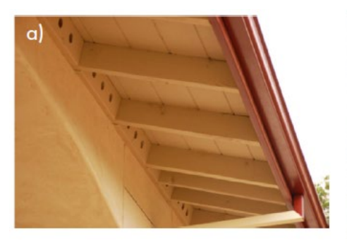
Figure 6. Images of a) open eave design that may allow ember penetration into the structure more readily than b) closed eave design that has been significantly associated with structure survival in California wildfires.

and the creation and management of defensible space around homes (Fig.4).