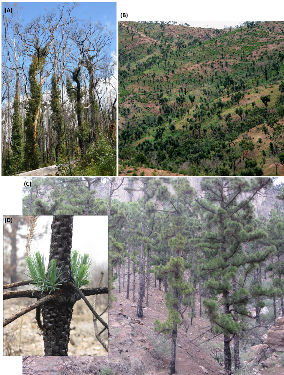
Trends in Plant Science

Perhaps one of the most thoroughly studied cases of epicormic resprouting is in the Australian genus Eucalyptus and the closely related genera Corymbia and Angophora [12,13]. Following high-intensity crown fires in these Eucalyptus forests, the vast majority of trees, regardless of size, resprout epicormically (Figure 1). Within less than 1 year these forests are well on their way to recovering their full canopy. However, resprouting is of variable importance in