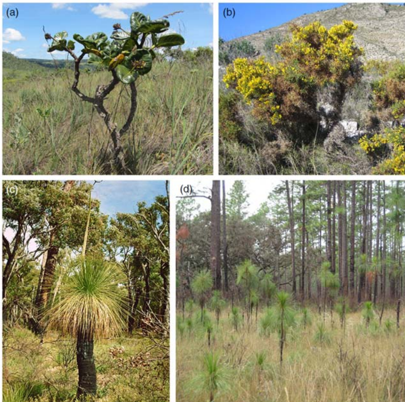
Fig. 2. Examples of species with different flammability strategies. (a) A non-flammable plant ( Palicourea rigida , Rubiaceae) living in an ecosystem dominated by fast-flammable grasses in a Brazilian savanna (cerrado); note the large and thick leaves and a trunk and branches covered by a thick non-flammable corky bark. (b) A hot-flammable plant ( Ulex parviflorus , Fabaceae) in a Mediterranean shrubland of eastern Spain; note its fine biomass, the high bulk density and the high amount of standing dead biomass. (c) A recently burnt fast-flammable plant ( Xanthorrhoea preissii , Xanthorrhoeaceae) in Australia; note the fine leaves and the post-fire flowering; this species accumulates dead leaves that facilitate burning (not shown in the picture because they were consumed by the recent fire). (d) A forest gap of a frequently burned pine woodland in Florida that shows a fast-flammable (grassy) understory together with pines ( Pinus palustris ) that have fast-flammable needles but the trees grow quick, and they self-prune the lower branches and thus become non-flammable. [Colour figure can be viewed at wileyonlinelibrary.com ]