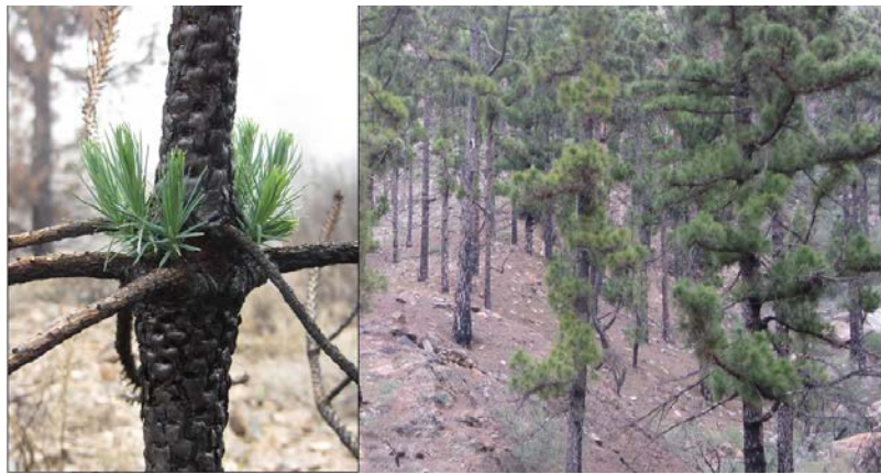
Figure 1. Examples of postfire epicormic resprouting after a crown fire. Left: Canary Island Pine ( Pinus canariensis ) woodland few years after fire; Right: epicormic resprouts of Canary Island Pine ( P. canariensis ) 3 months postfire.