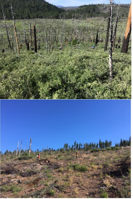
Figure 2. Pre (a), and post (b) site preparation. Pretreatment (a): extensive, continuous shrub cover with many standing dead trees characterize the area. Posttreatment (b): shrub cover is limited to small, scattered patches with shorter stature. Few snags remain but a scattering of fine fuels is visible. Areas in (a) and (b) are representative but are not identical locations.

When salvage logging is not conducted, standing snags begin to deteriorate and fall, further contributing to very large, continuous surface fuel loads characterized by a complex arrangement of downed wood in a homogenous matrix of live shrubs. Mechanical site preparation treatments can effectively reduce total fuel loads and continuity of fuel profiles. Site preparation treatments a decade after the fire reduced 1000hr fuels to an average of 57.8 Mg/ha (25.8 tons/ac) which is often greater than desired; however, these mechanical treatments altered the overall structure of the fuel profile which may help facilitate the future use of prescribed fire to further manage fuels. Timing of mechanical site preparation treatments may impact the extent to which fuel loads are reduced. If left for too long, snag and downed log deterioration may reach a point where mechanical equipment is unable to efficiently remove and pile them for burning due to breakage. This highlights the importance of timeliness in post-fire restoration efforts.